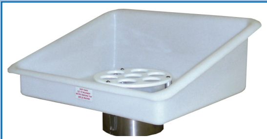
PLASTIC COVERED FEED TRAY