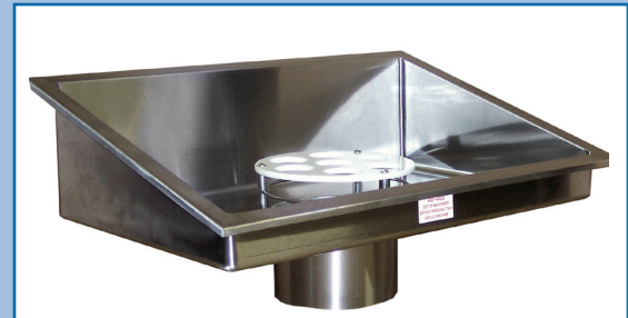
STAINLESS STEEL COVERED FEED TRAY