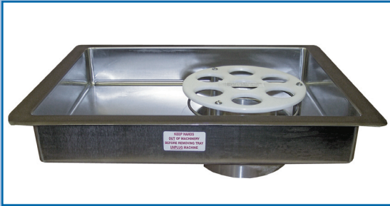
LOW PROFILE STAINLESS STEEL FEED TRAY